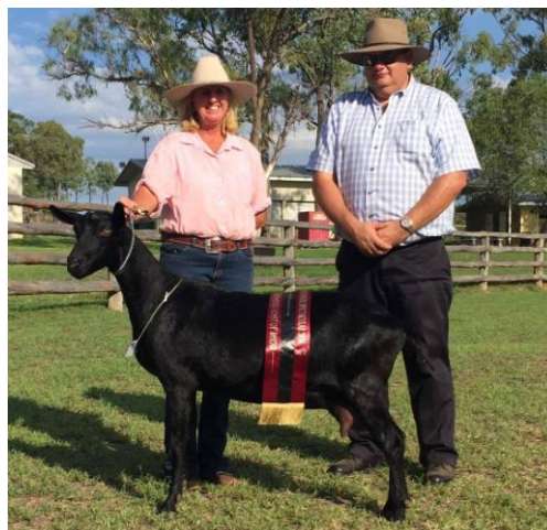
Grand Ch Doe