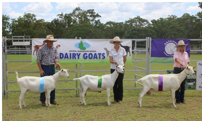
Ch. Saanen, Res Ch and Highly Commended Saanen Does