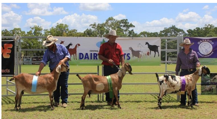
Ch Anglo Nubian, Res and Highly Commended AN Does