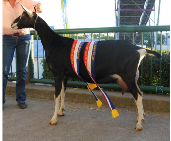
Supreme Ch Doe - Poldark Splendour