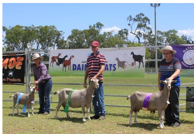
Ch Toggenburg Doe, Res Ch and Highly Com Does