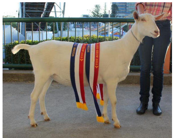
Jazstar Lodge Lucinda