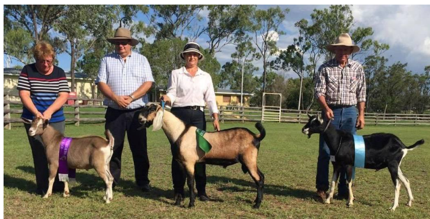
Ch Buck Kid, Res and Highly Commended Buck Kids