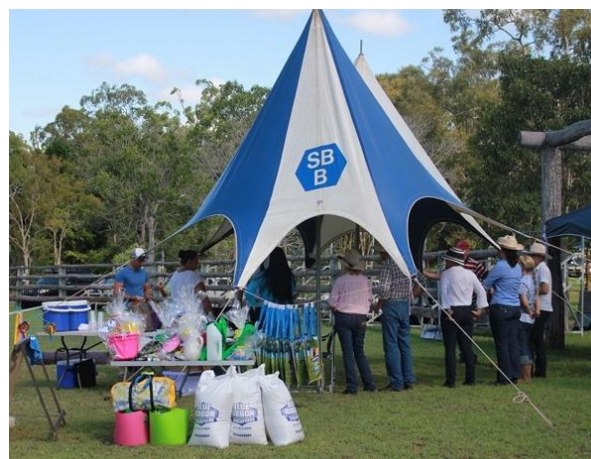
Exhibitors meeting and Trophies