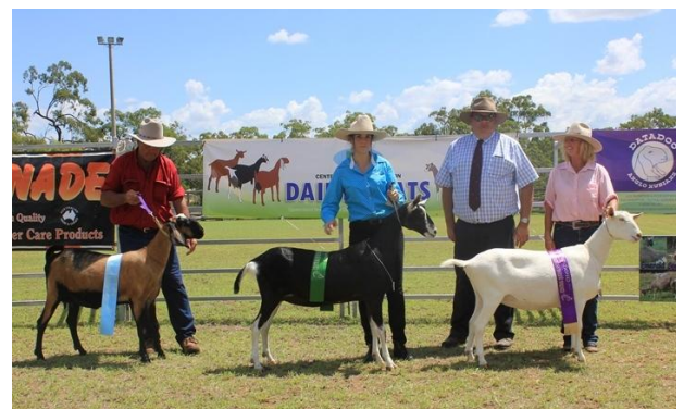
Junior Ch, Res Jnr Ch and Highly Commended Does