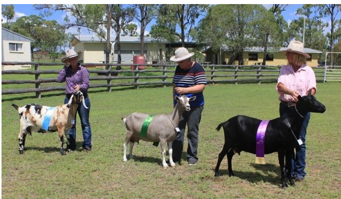
Senior Ch, Res Ch and Highly Commended Does