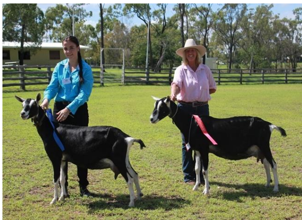
Champion British Alpine Doe and Reserve