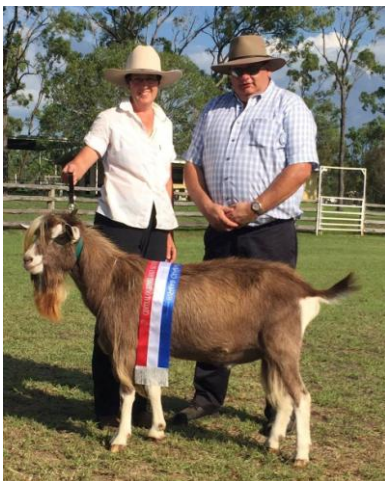
Grand Ch. Buck