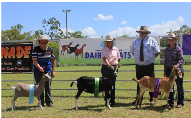
Ch Doe Kid, Res Ch and Highly Commended Doe Kids