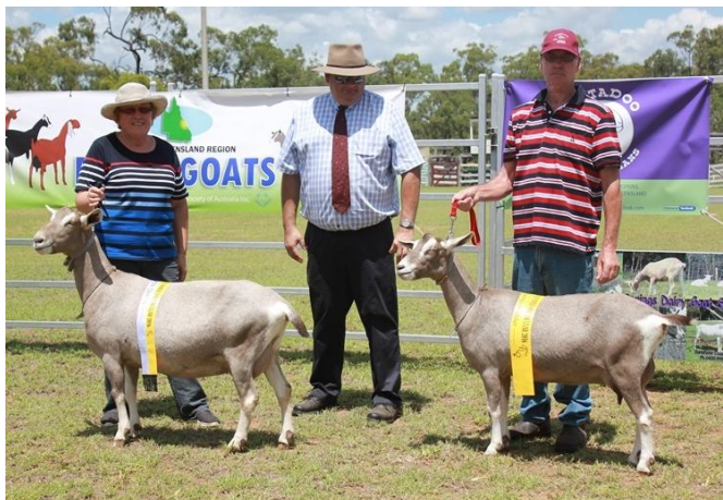
Best Uddered Doe and Reserve