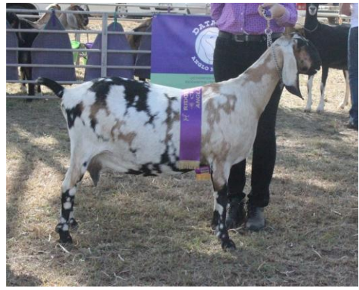
Champion Anglo Nubian Doe