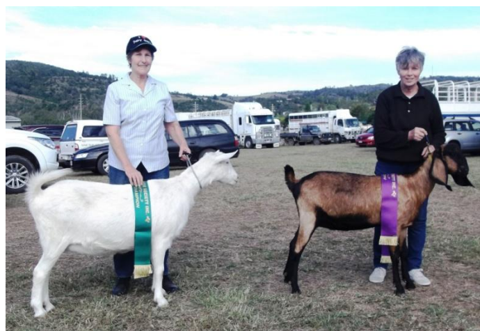
Res Ch Junior Doe and Ch Junior Doe