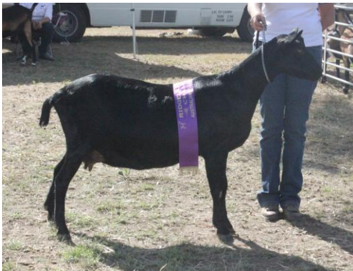
Champion Australian Melaan Doe