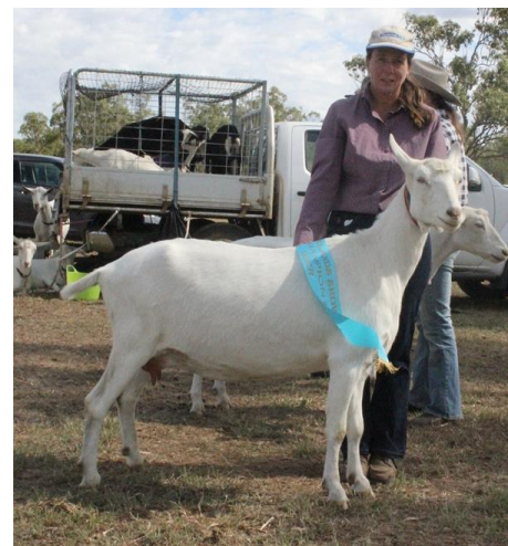
Best Udder of Show