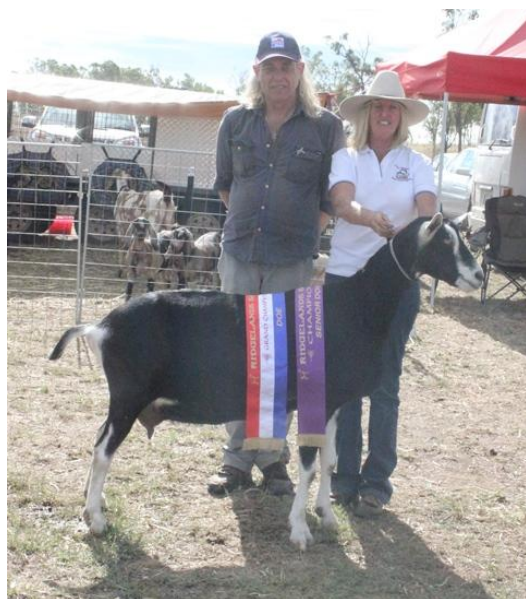
Grand Champion Doe