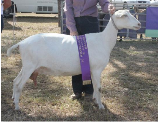
Champion Saanen Doe