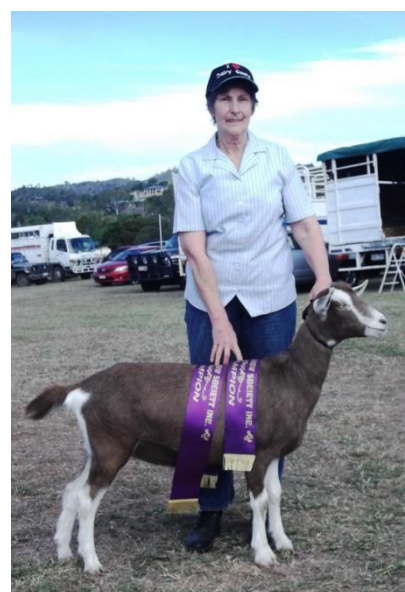
Ch Toggenburg Doe, Ch Doe Kid