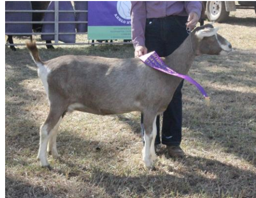
Champion Toggenburg Doe