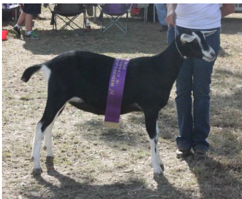
Champion Doe Kid