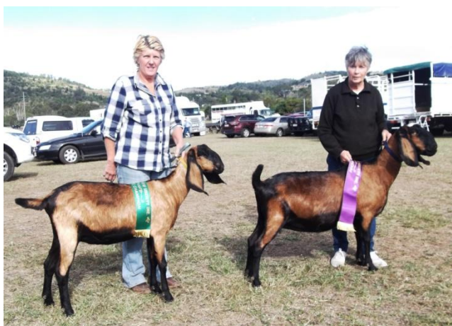
Res Ch Anglo Nubian Doe and Ch Anglo Nubian Doe