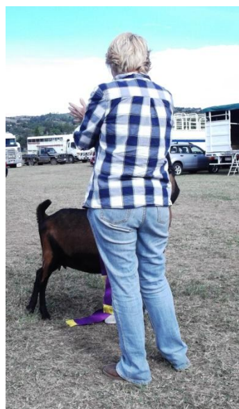
And who is this holding up the photographer?