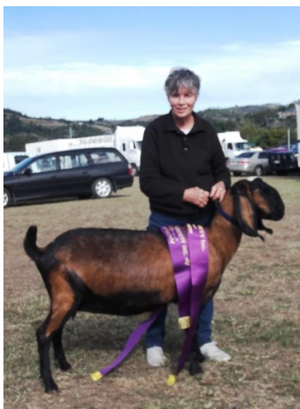
Ch Anglo Nubian and Grd Ch Doe