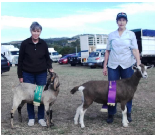
Res Ch Doe Kid and Ch Doe Kid