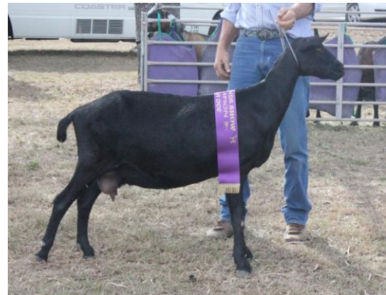
Junior Champion Doe