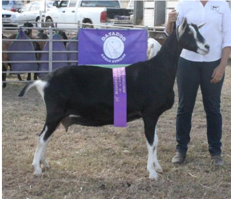
Champion British Alpine Doe