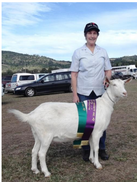
Ch Saanen Doe, Res Ch Jnr Doe