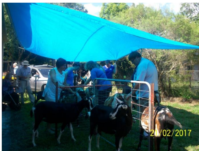
Some of the trainees waiting their turn