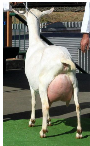
Best Udder EKKA 2009