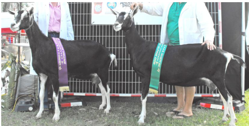
Champion and Res Ch British Alpine Does