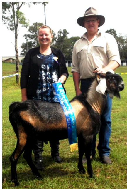
Ch Buckling & Grand Champion Buck