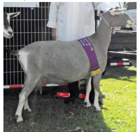
Ch Toggenburg Doe