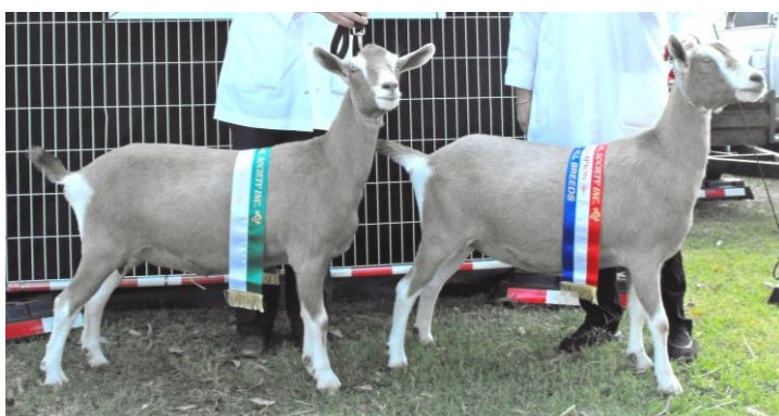
Res Ch and Ch Toggenburg Doe Kids