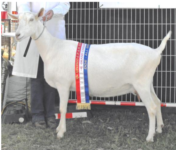
Ch Saanen, Best Udder, Grand Ch Doe