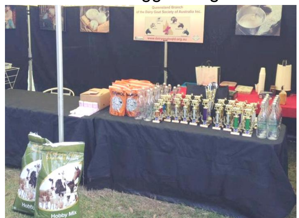
The Trophy Table