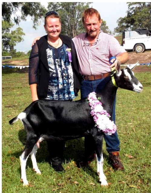
Grd Ch Doe, Supreme Exhibit