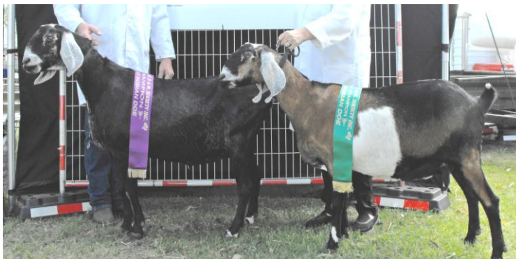
Ch and Res Ch Anglo Nubian Does