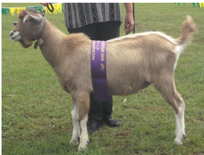
Champion Buck Kid