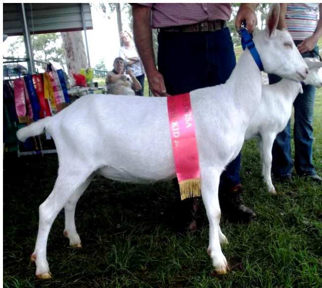
Ch Saanen Doe Kid & Ch Doe Kid Overall