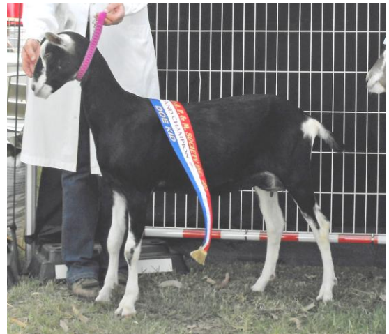
Junior Champion Doe