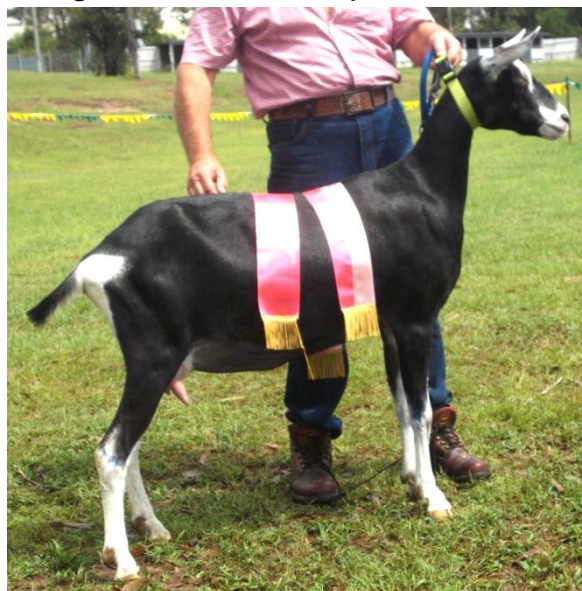
Snr Ch Goatling Ch Goatling Overall