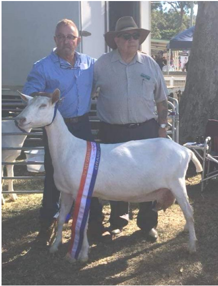
Cedarvale Park Sparklet Best Udder, Champion Saanen Doe Senior Champion Doe, Grand Champion: