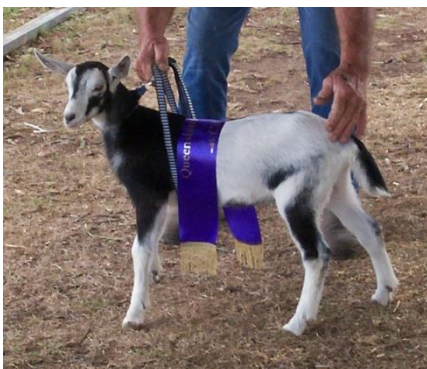
K-Lee Shining Gem Res Ch Doe Kid