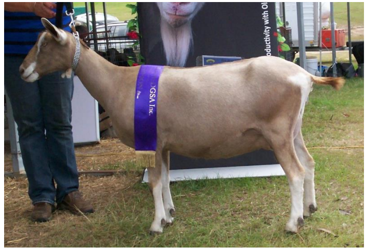
Burstow Park Cache Dixie Ch Toggenburg Doe, Res Snr Ch Doe