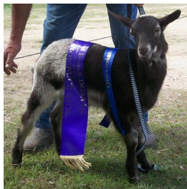
K-Lee Smoky Quartz Ch Buck Kid