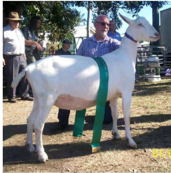
Cedarvale Park Maria Reserve Champion Saanen Doe Res Junior Champion Doe