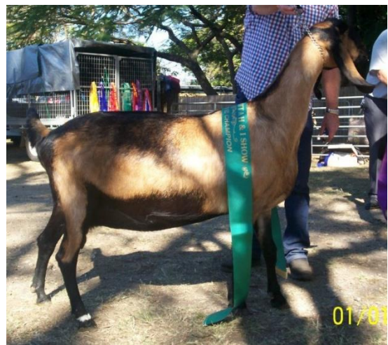
Glengyle Ana Kasii Kalina Reserve Champion Anglo Nubian Doe & Reserve Senior Champion