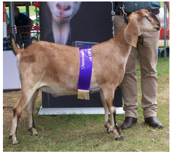
Lima Indira, Ch Anglo Nubian Doe, Reserve Junior Ch Doe