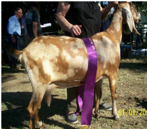
Hidden Valley Rennie Champion Anglo Nubian Doe