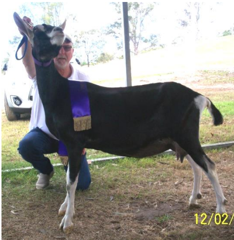
Glendowen Bel Rose Ch British Alpine Doe