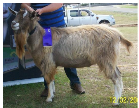
Burstow Park Cache Duke Ch Toggenburg Buck Senior & Grand Ch Buck