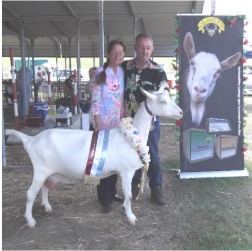
Cedarvale Park Sparklet, Ch Saanen Doe, Best Udder, Senior Ch, Supreme Exhibit