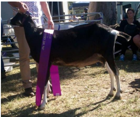
Cedarvale Park Sadie Champion British Alpine Doe