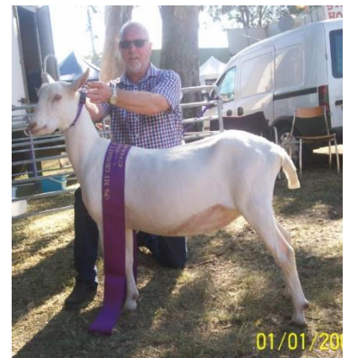
Cedarvale Park Fragrant Rose Champion Doe Kid