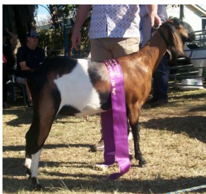
Lima Carmen Junior Champion Doe