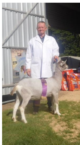
Ch Doe Kid

The golden Rule of life has always been — Treat others the way