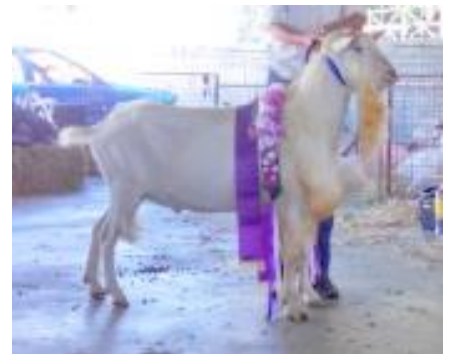
Grand Ch Buck