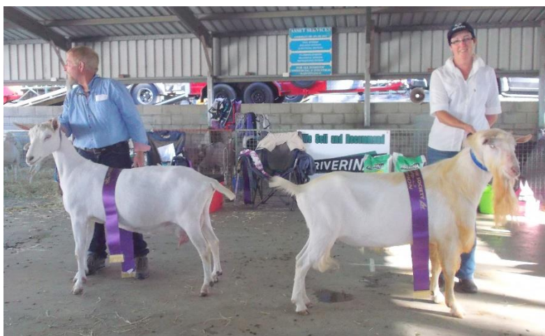
Grand Ch Doe and Grand Ch Buck Ipswich Show 2018