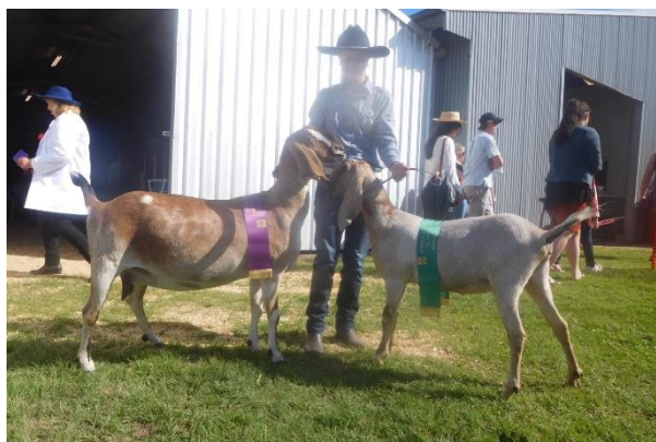
Ch and Res Ch Anglo Nubian Does