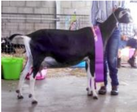
Ch British Alpine Doe