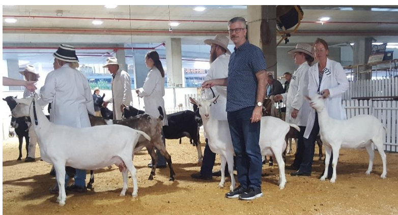
INTERBREED GROUP The Pioneers Memorial Interbreed Group. First the Saanen Group.