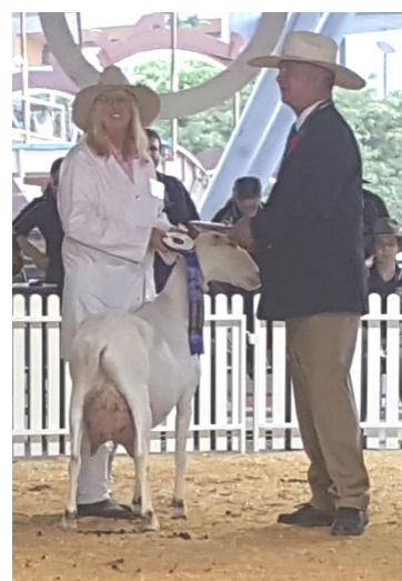
Supreme Champion Doe