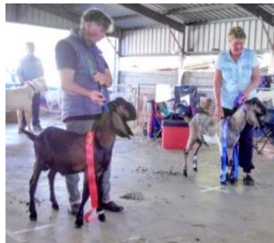
Anglo Nubian Buck Kid class