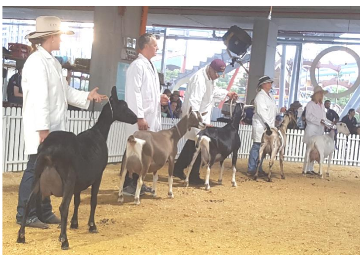
Line-up for the Supreme Champion Doe