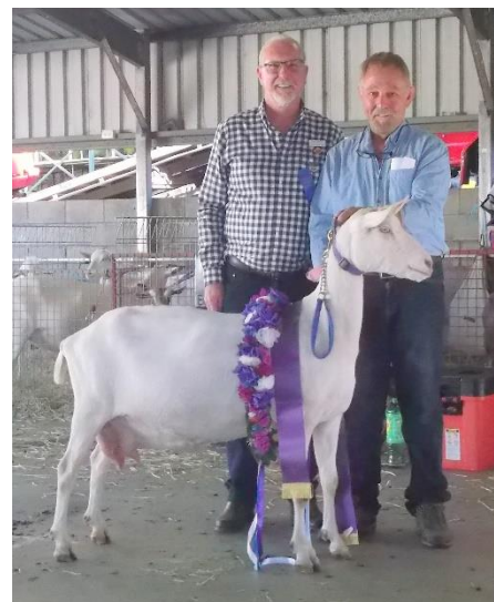
Grand Ch Doe