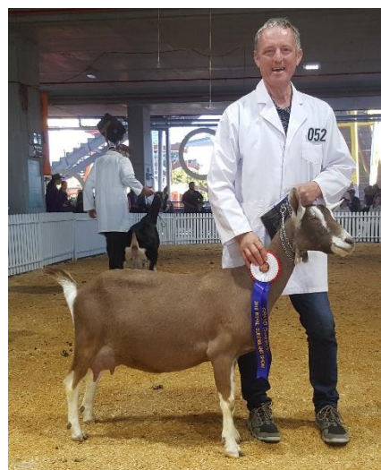
Grand Ch Toggenburg Doe