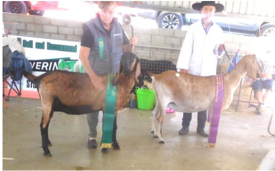
Ch and Res Ch Anglo Nubian Does