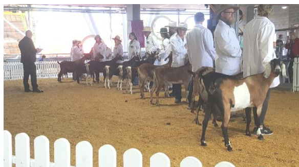
Best Udder first lactation – 12 entries