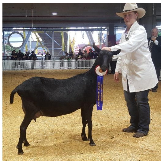
Grand Ch A.Melaan or A.Brown Doe