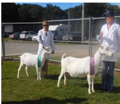
Ch and Res Ch Saanen Does