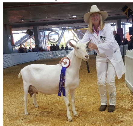
Grand Champion Saanen Doe