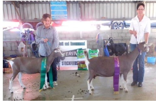
Ch and Res Ch Toggenburg Does