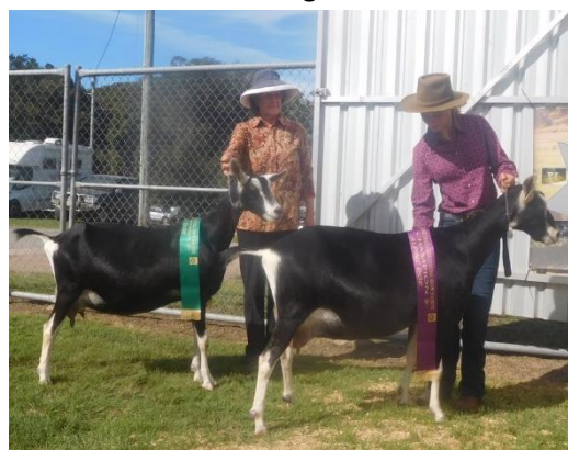
Ch and Res Ch British Alpine Does