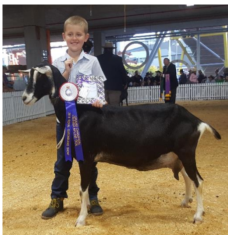
Grand Ch British Alpine Doe