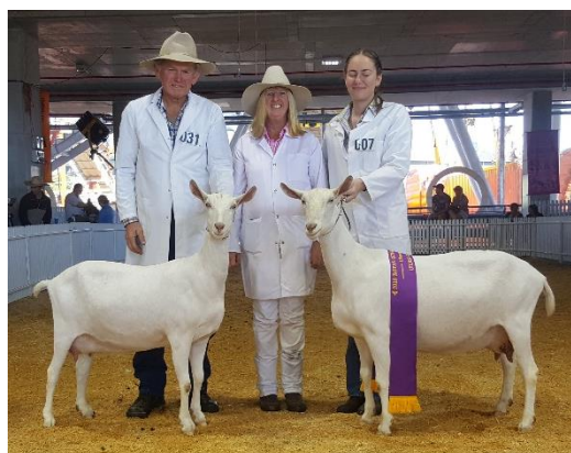
L. First in 1 st Lactation