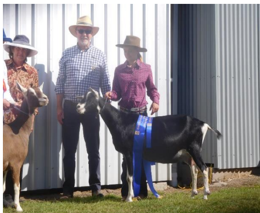
Best Uddered Doe