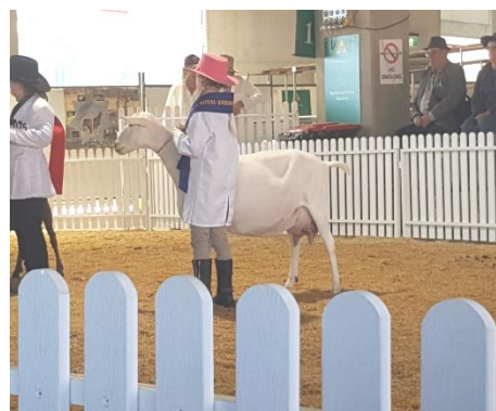
Junior Handler 10 to 18 yrs old