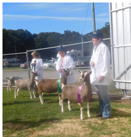
Ch and Res Ch Toggenburg Does