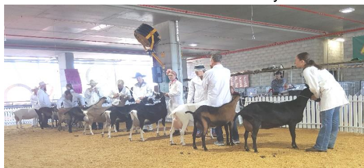
Best Udder 2nd or subsequent lactation 11 entries