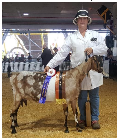
Grand Ch Anglo Nubian Doe