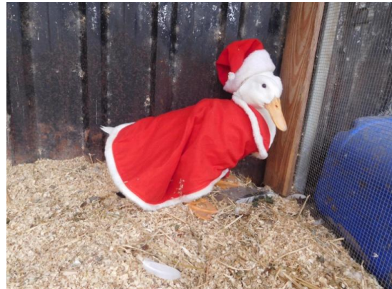
No one misses out at Xmas time here.