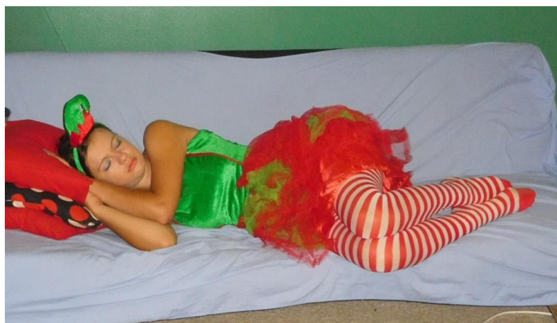
A well earned nap for an elf after a hard night's work with Santa. (Comments by editor and another member.)