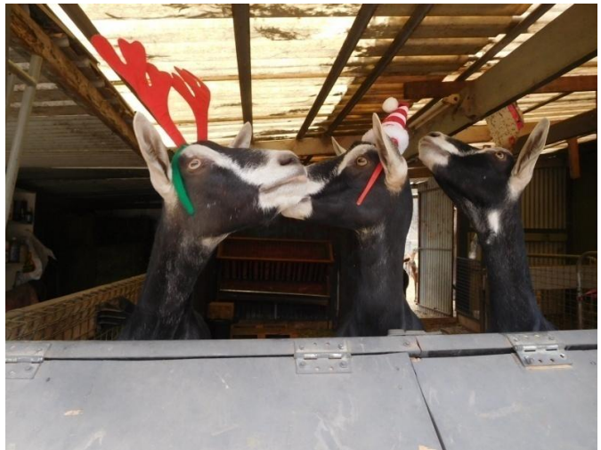
Santa! Here we are, down here Santa!