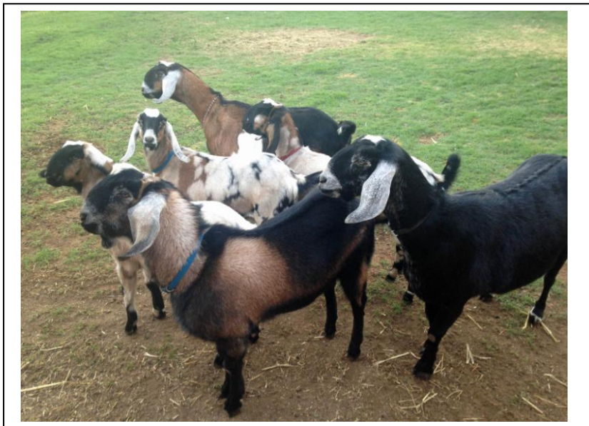
Top: Huntinglea Kaela, Tyenna (red collar), Tarraleah (blue collar), Tamar and our Buck Kid Tasman in front with Tara on the right. Tyenna, Tarraleah, Tamar and Tasman are all name places in Tasmania.