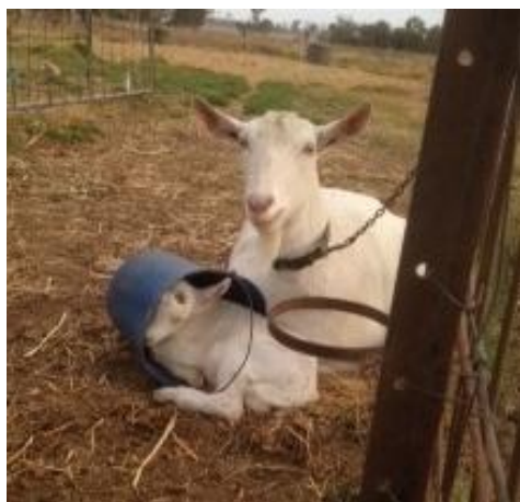
Kids always seem to find unusual sleeping spots.

A DWARF BILLY GOAT gave new meaning to the word 'scapegoat' when he busted out his best friend, a huge Clydesdale horse. The horse went on the run in the Santa Cruz Mountains, California.