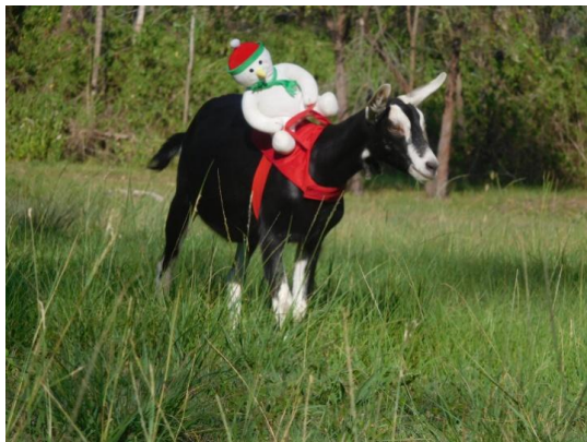
Reindeers were in short supply today.