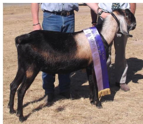
Ch Anglo Nubian Buck / Grand Ch Buck