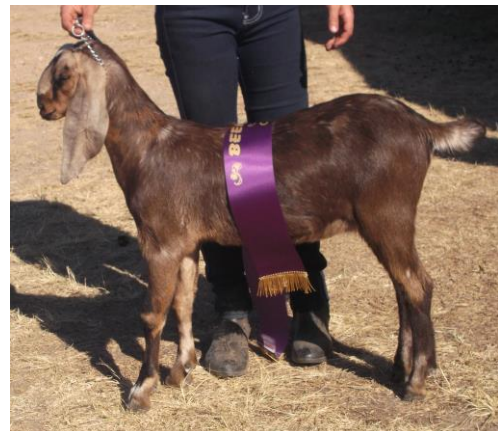
Ch A. N. Doe Kid / Ch Doe Kid