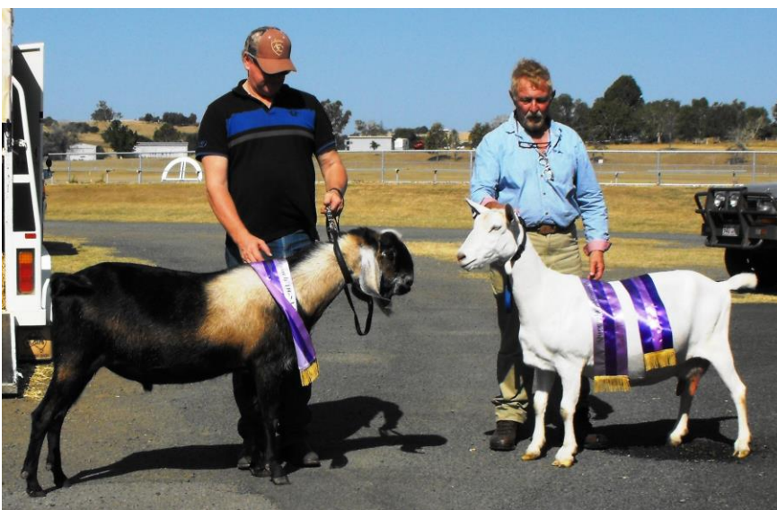
Grd Ch Buck with Ch Saanen, Grd Ch Doe & Supreme Exhibit