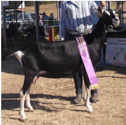
Jnr Ch B A Doe / Jnr Ch Doe All Breeds