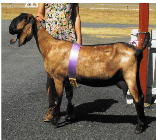
Ch Anglo Nubian Doe