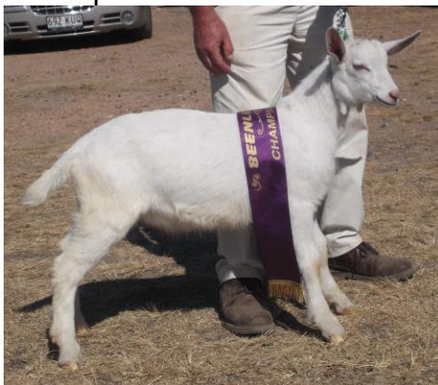
Ch Saanen Buck / Ch Buck Kid