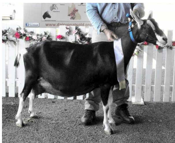
Ch British Alpine Doe