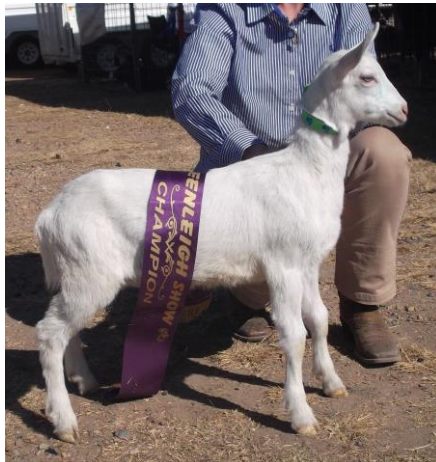
Champion Saanen Doe Kid