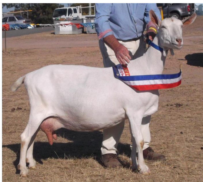
Ch S., Grd Ch Doe, Supreme Champion and Best Udder of Show