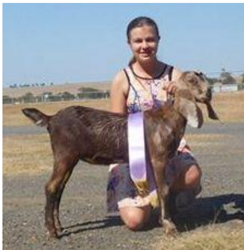
Ch Doe Kid All Breeds