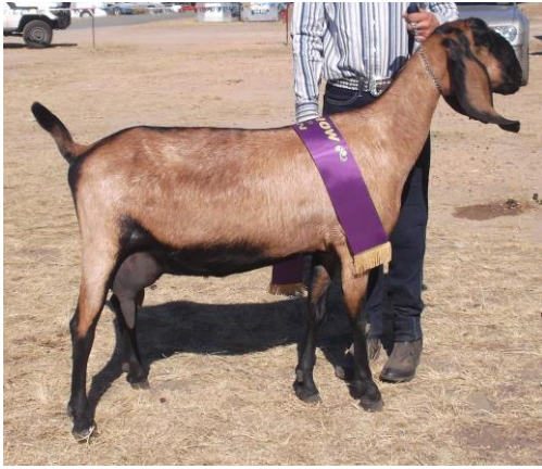
Champion Anglo Nubian Doe