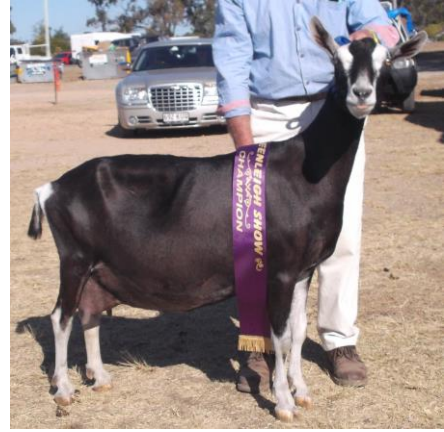
Champion British Alpine Doe