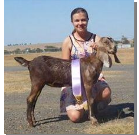
Jazstar Lodge Shakira