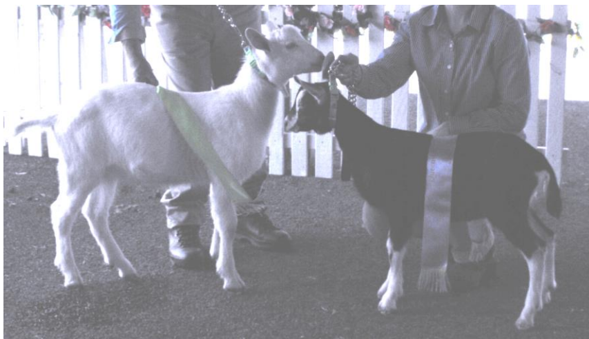
Res Ch and Ch Buck Kids