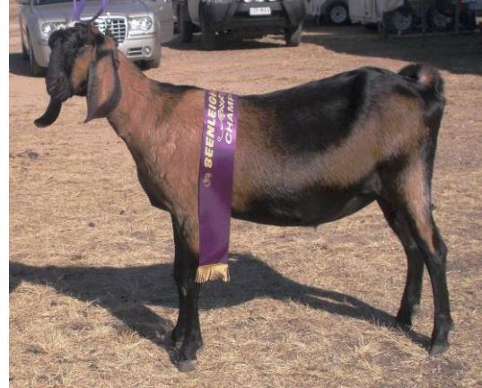
Junior Champion Anglo Nubian Doe